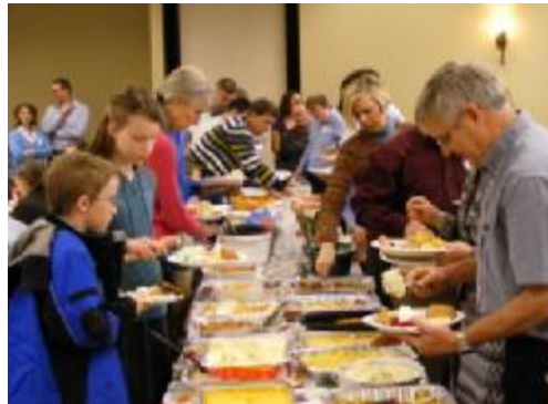
Feast of Thanks 2008

Coolers and ovens are available to keep your dishes warm or cold as needed. You may bring your dishes to the welcome area and they will be taken care of for you. Please RSVP online, on your care card, or by calling the office by Nov. 15.